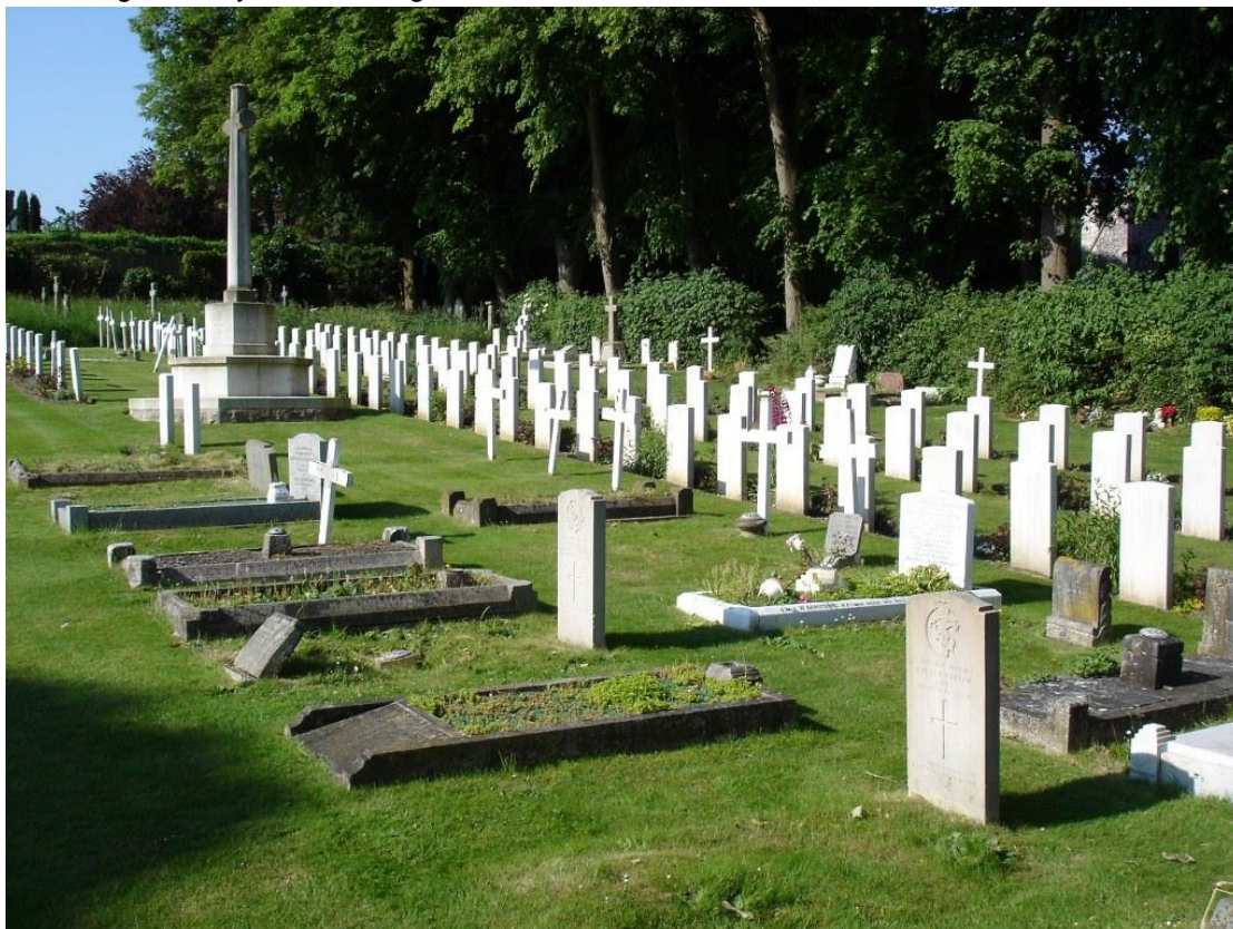
Christ Church Military Cemetery, Portsdown

Christ Church Military Cemetery, Portsdown contains 167 Commonwealth War Graves - 133 from World War 1, including 2 from Belgian Army & 34 relating to World War 2. There are 6 Australian World War 1 War Graves.